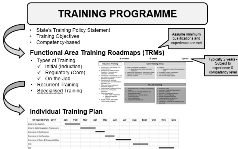
Figure 1. Training Programme Overview

2.4 Member States/Administrations are encouraged to use the SCBP to develop training programme for their technical personnel. The training programme should include a policy statement to guide the implementation of the programme which is intended to meet the training objectives defined by the Member States/Administrations. Competency-based training methodology could also be incorporated in the overall training objectives to complement the traditional training so as to provide targeted skills training in addition to the transfer of knowledge.